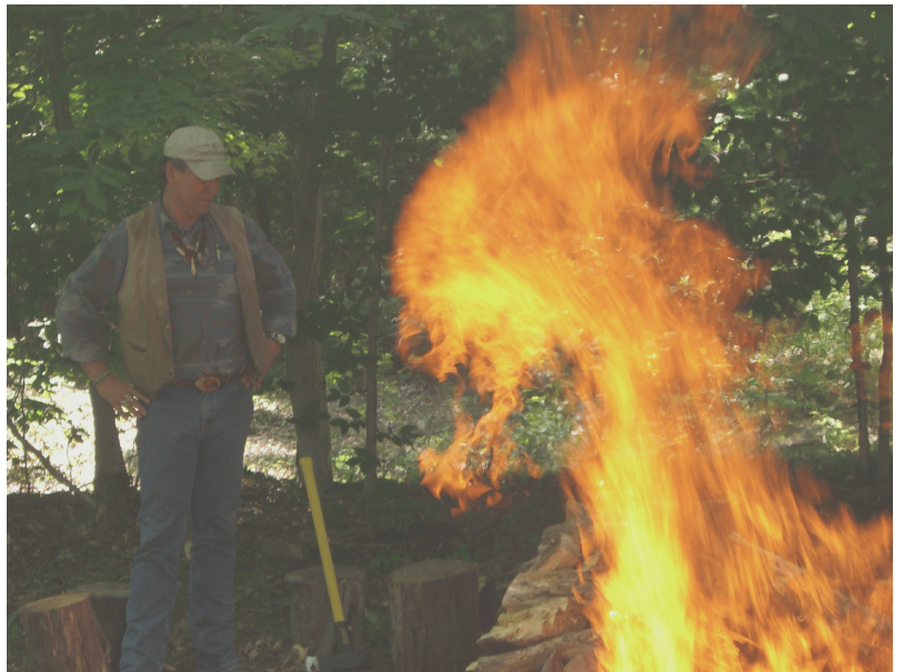
Fire Spirit at Sweat lodge

The program has given me the tools to be a better man, peace within myself that I have never had in my 59 years, and to know how I am part of all God's creations from the earth to the stars above and everything in between. I learned how everything from the seasons, animals, water, rocks, birds, and trees, including me, are tied to each other. I can now see better as to what is really important and lasting for real peace and happiness.